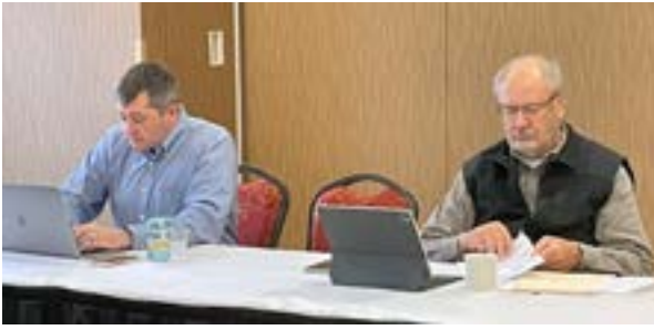
Thank you to all of our Board Members for taking the time out of your busy schedules to attend this meeting.